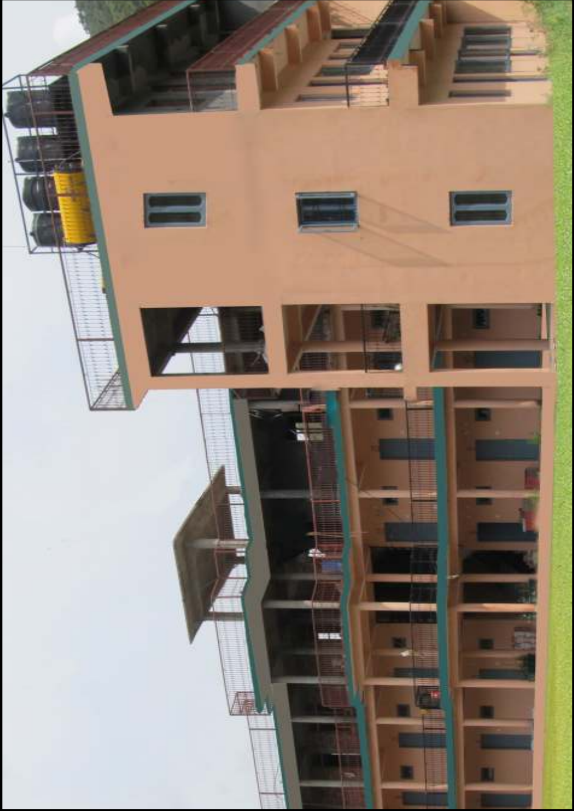
Hostel Building at Kotla Barog

Printed by: SHIV PRINTERS, Solan: 01792-224442